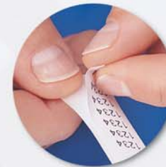
Leading edge makes peeling easy!